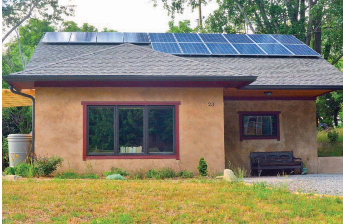
Located on Trade Street in the River Arts District of Asheville, this home was built by Cady & Guyton Construction. The structure features solar panels, rainwater collection and a high-efficiency water pump.