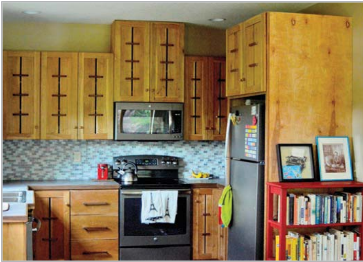
One key feature of the kitchen is the handmade cabinets, with the material coming from wood harvested from a lot in West Asheville.