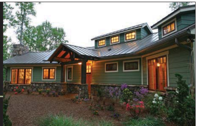
Builder of North Carolina's tightest tested home.