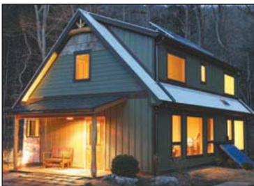
Passive Solar Design Specialists