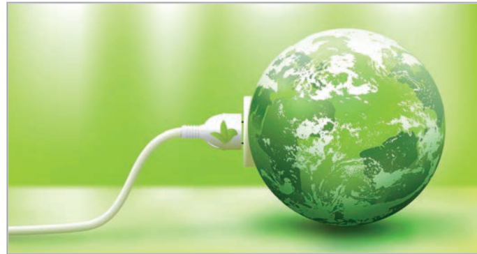
City of Asheville

Natural gas is a far cry from clean, renewable energy and hopes are high that the Task Force can delay or avoid the construction of